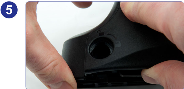
Lift the foot cover.