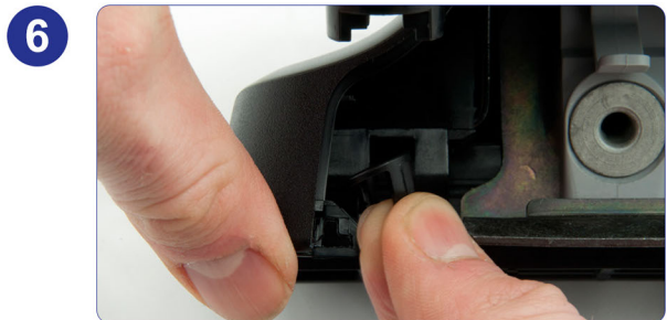
Remove the detached lock plug and discard.