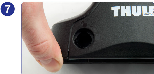
Close the foot cover.