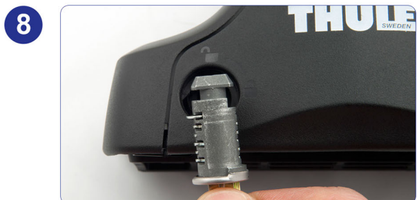
Make sure the key is fully inserted into the lock barrel. This will leave one 'tooth' sticking out.