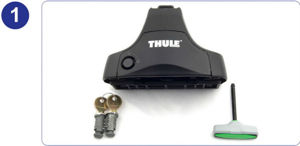
Empty contents of foot pack. (4 x feet, 4 x allen keys, 4 x locks + keys)