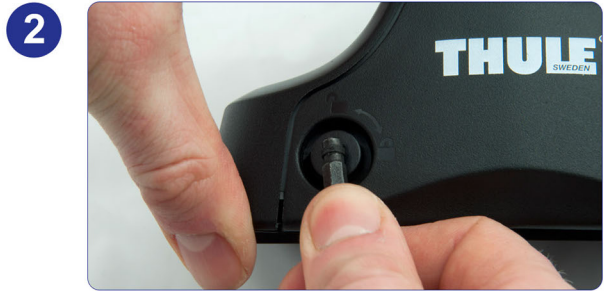
Place the end of the allen key in the centre of the plastic lock plug.