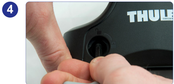
The lock plug should drop into the foot.