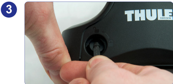
Push down until you hear a 'click'.